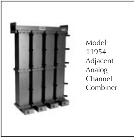
Model 11954 Adjacent Analog Channel Combiner