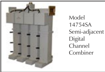
Model 14754SA Semi-adjacent Digital Channel Combiner

This series of combiners offers the user the benefits of low loss copper performance without the usual expense associated with copper construction. The "Q" series offers the same flexibility as the aluminum series in meeting your specific headend requirements. A choice of bi-directional inputs allows the combiner output to be directed left or right. A variety of copper adapters and mounting configurations permit easy installation and cable access.