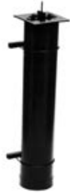
96xx -(F o )(# sections)(BW 3 ) F o = Notch frequency

Please feel free to contact the company toll free for additional information.